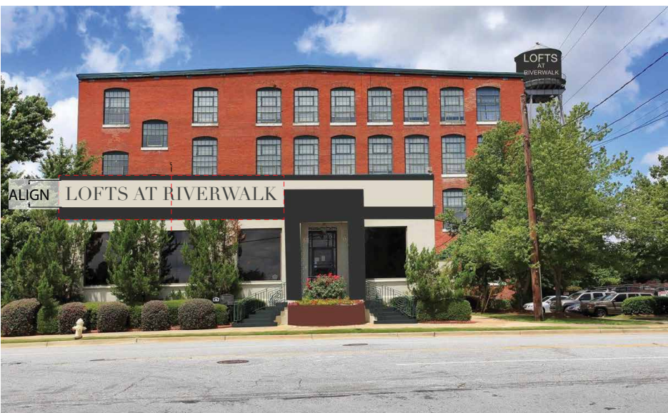
4 VIRTUAL ELEVATION Scale: N.T.S.