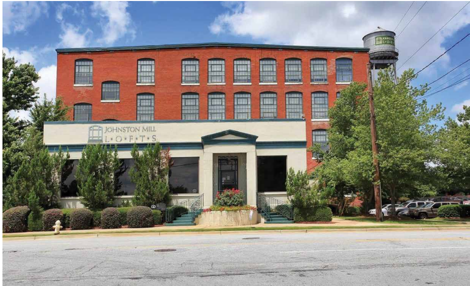
3 EXISTING CONDITIONS Scale: N.T.S.