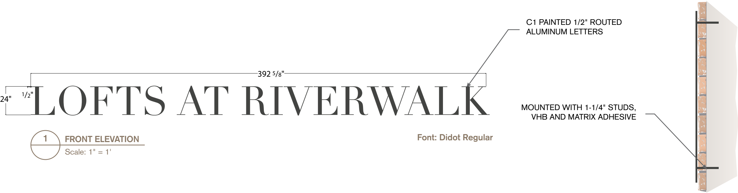
1 FRONT ELEVATION Scale: 1" = 1'